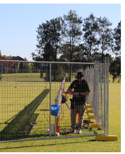
The temporary location of the demountables (on the western side of the oval area closest to Morris Grove) has now been fully fenced off and we are beginning the process of installing the foundation blocks for the demountable classrooms to sit on.