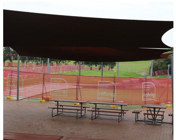
The building site boundary has now been fully fenced off on the eastern side of the oval area, extending to the edge of the Drama classrooms and the end of the Science building. We are now preparing the site for construction.