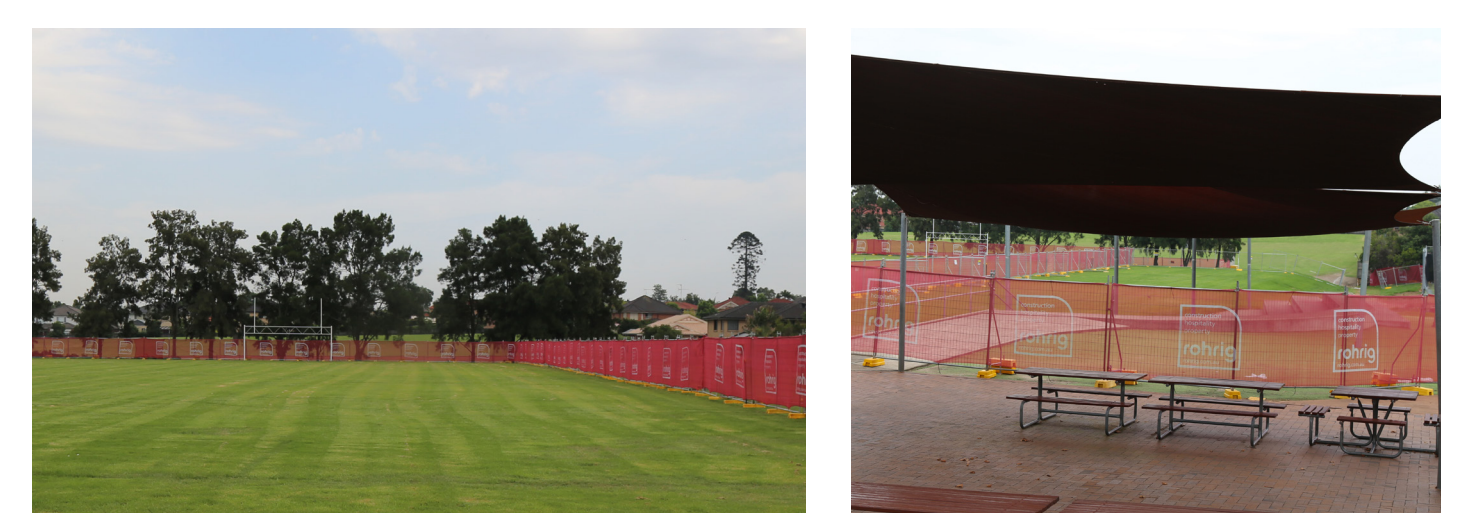
The building site boundary has now been fully fenced off on the eastern side of the oval area, extending to the edge of the Drama classrooms and the end of the Science building. We are now preparing the site for construction.